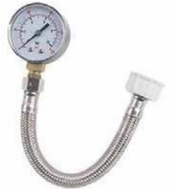
FIG1: WATER PRESSURE GAUGE

Appropriate screws to mount the filter to the vertical surface (e.g. wood screws)