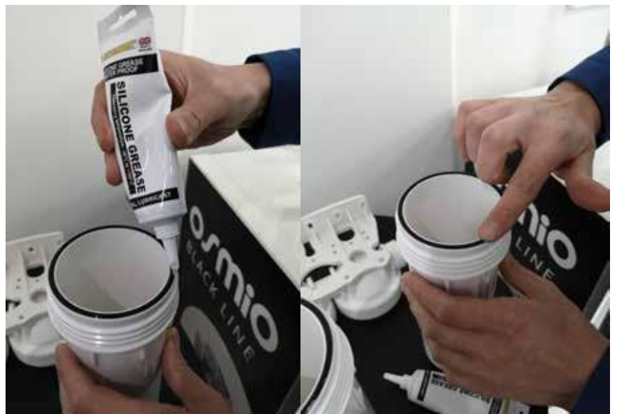
FIG4: GREASING THE O RINGS

First clean your hands and then apply the grease to the ring generously and run your finger around the ring as shown.