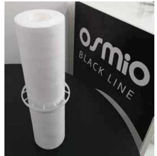
FIG5: SPACING RING IS NOT NEEDED BUT CAN BE USED WITH SEDIMENT FILTERS

Skip to the relevant section for the product you are installing. Please ensure you install the filters in the correct order shown which is in accordance with the flow directions.