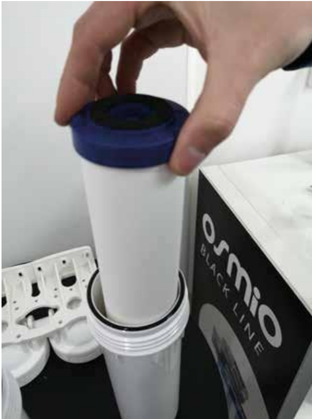
FIG6: THE RUBBER WASHER GOES ON THE TOP OF THE FILTER