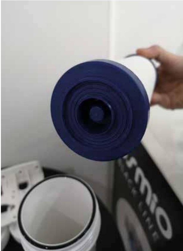
FIG7: THE BOTTOM AND CLOSED END OF THE FILTER

Filter 2; Osmio 2.5 x 10 Chlorine & Limescale Filter: As per previous section.