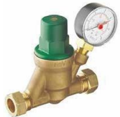
FIG2: PRESSURE REDUCING VALVE WITH GAUGE