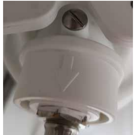
FIG3: DIRECTIONAL ARROW OF WATER FLOW

Note the arrows showing the direction of flow. The arrow points in the direction of flow to the tap. You can mount the bracket either way round according to whether you are installing on the left or the right hand side of the cupboard. Using the phillips head screwdriver, screw the bracket to the filter unit.