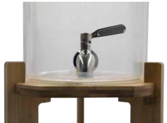
Wooden Base and Stainless Steel Tap with Fittings

Wooden Lid with Metal Handle and Air inlet Valve (which lets air in to stop air locks)